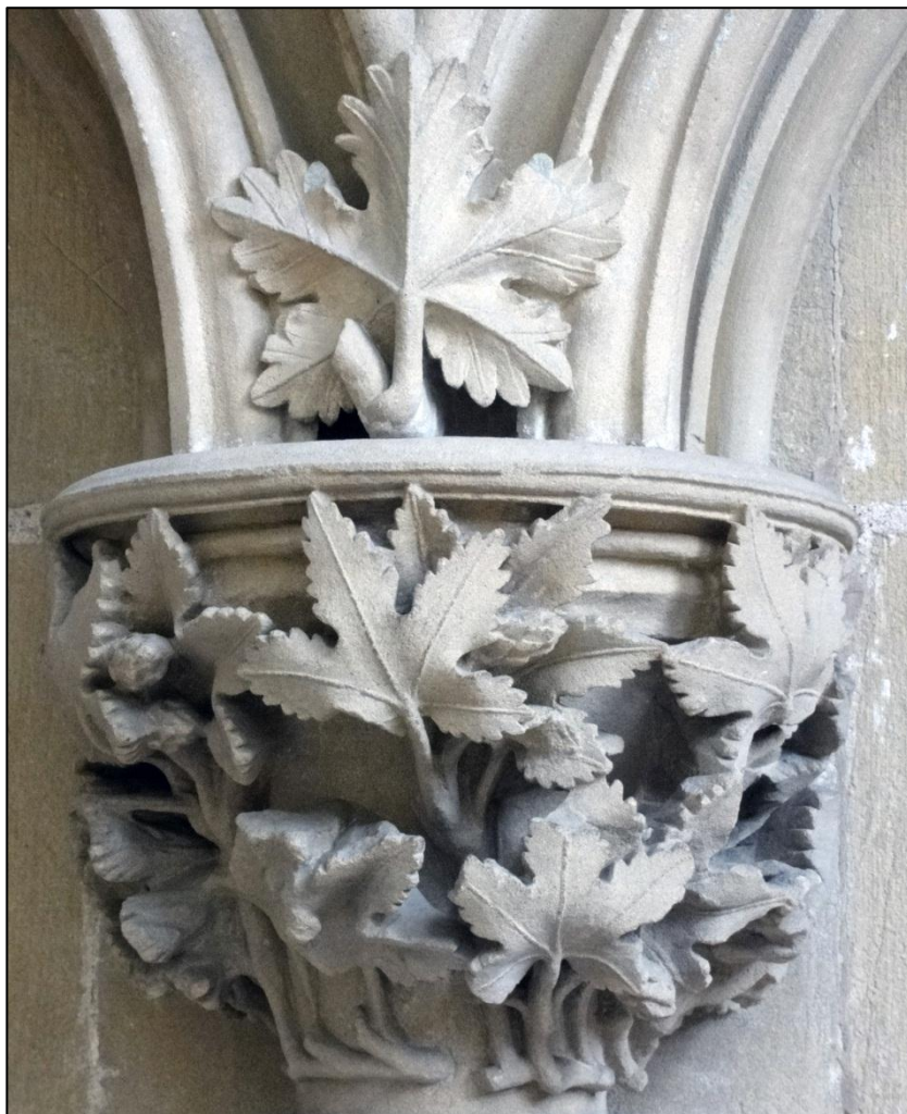
The Leaves of Southwell; a highlight of our 2011 trip to Nottinghamshire.