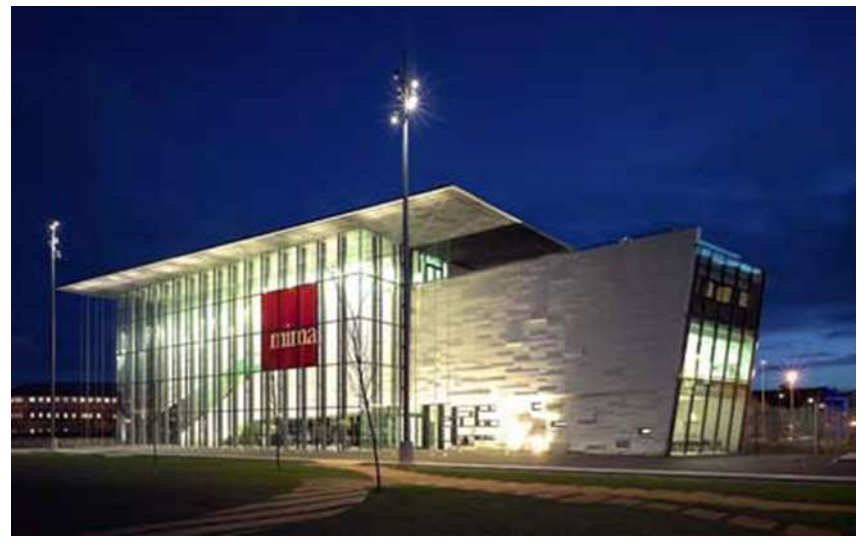
Middlesbrough Institute of Modern Art